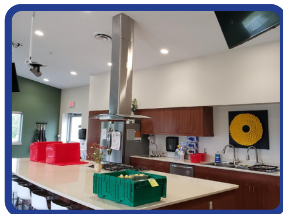
Parkview Health Teaching Kitchen

In addition to the support from the Builder's Initiative Foundation, the Healthy Hoosiers Foundation received a donation of $20,000 from the Rockefeller Foundation, solely designated to DNPA. The DNPA plans to use those funds towards the Double Up Indiana program.