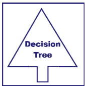
Figure 1.1 Decision Tree How to Address Suicidal Thoughts and Behaviors in Substance Abuse Treatment