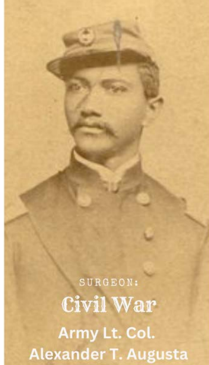
SURGEON: Civil War Army Lt. Col. Alexander T. Augusta