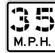
XW13-1-A (To be used below a warning sign only.)