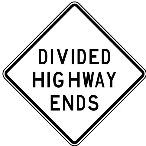
XW6-2a-A XW6-2a-B ①