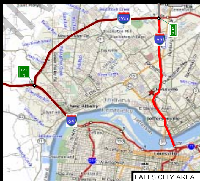
FALLS CITY AREA