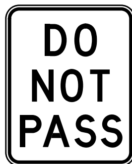
R4-1 R4-1-B ①