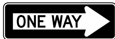
R6-1 (R or L)