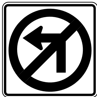
R3-2a R3-2c ①