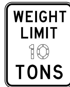
R12-1 R12-1-A ①