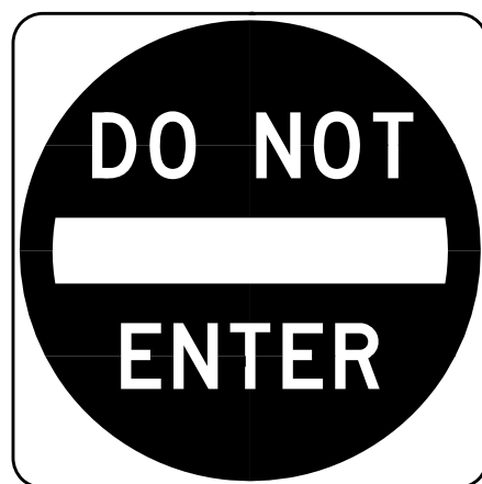
R5-1-A R5-1-B ①