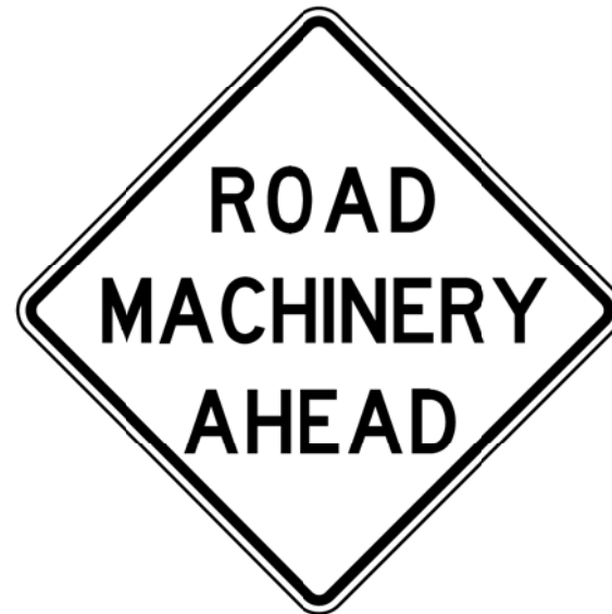
XW21-3-A (10) (9)