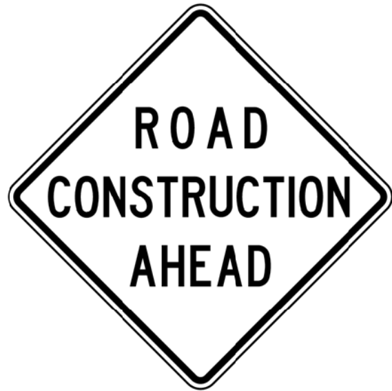
XW20-1 XW20-1-A (10)