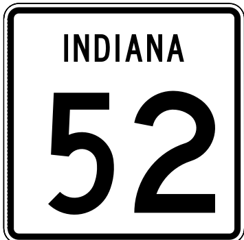
WHITE BACKGROUND WITH BLACK LETTERS, NUMERALS AND BORDER

M1-16 M1-16a M1-16-A M1-16a-A M1-16-B M1-16a-B