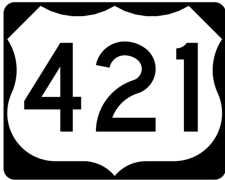
WHITE BACKGROUND WITH BLACK BORDER AND NUMERALS

M1-4(I) M1-4a(I) M1-4-A(I) M1-4a-A(I) M1-4-B(I) M1-4a-B(I)