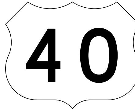
WHITE BACKGROUND WITH BLACK NUMERALS

M1-4(G) M1-4a(G) M1-4-A(G) M1-4a-A(G) M1-4-B(G) M1-4a-B(G)