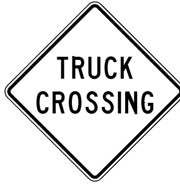
XW8-6-A XW8-6-B (1)