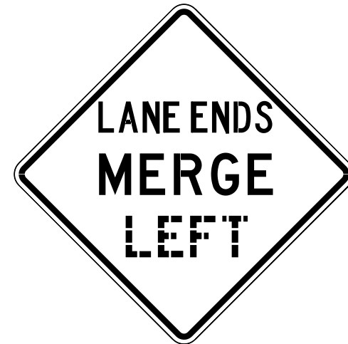
XW9-2-A (R or L)

All dimensions are in mm unless otherwise specified.