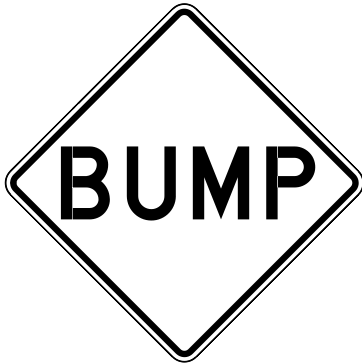
XW8-1-A XW8-1-B (1)