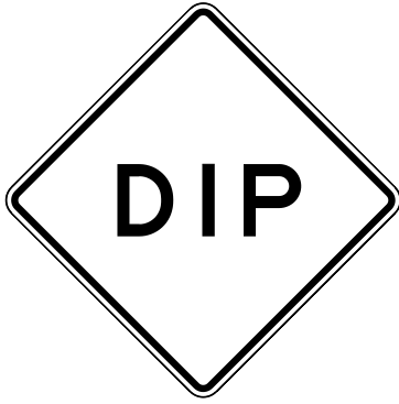
XW8-2-A XW8-2-B (1)