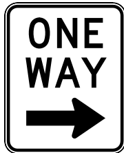
R6-2-A (R or L)