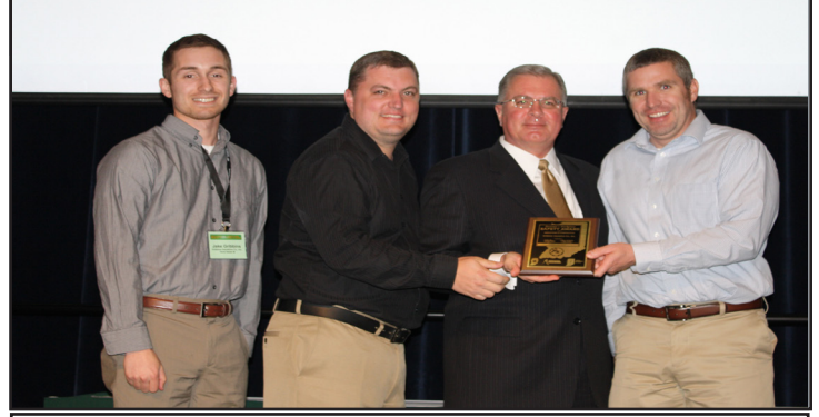
Gribbins Insulation Company Incorporated - Innovations in Construction

The group and forum worked together to create and celebrate the first U.S. Industry Safety Week. This weeklong event, held in 2014, helped raise awareness of the importance of providing a safe and healthy workplace and the need to remain injury-free every day. Activities included top management visits to jobsites, jobsite safety audits and a thorough review of safety policies, procedures and training requirements. BMWC Constructors has also achieved certification in the Indiana Voluntary Protection Program.