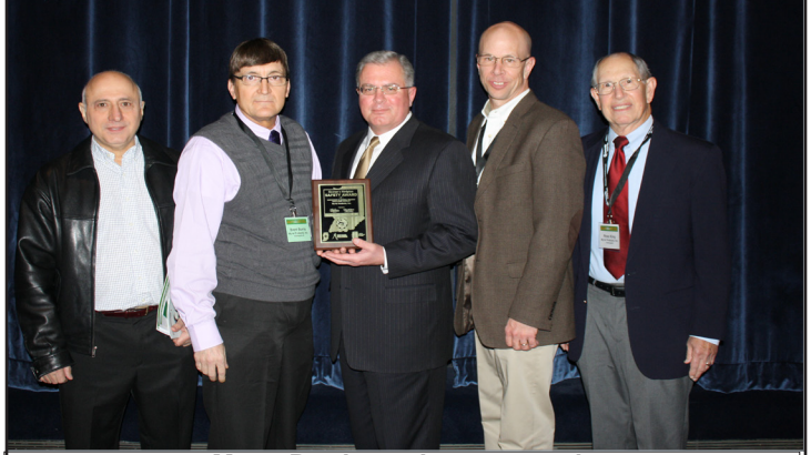
My-te Products, Incorporated -Innovations in General Industry for a Small-Sized Company

Gribboms Insulation Company has also achieved certification in the Indiana Voluntary Protection Program.