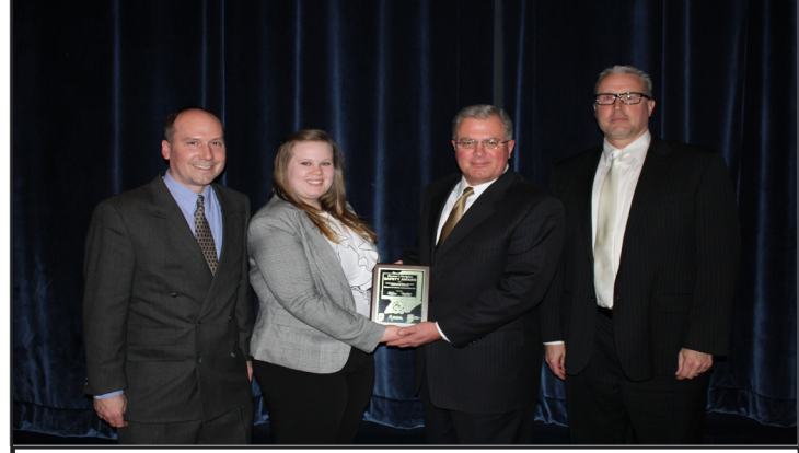
Subaru of Indiana Automotive, Incorporated - Innovations for General Industry for a Large-Sized Employer

Toyota associates recently participated in ergonomics training. This increased focus on ergonomics helped identify plant processes that needed improvement. One process required three employees to lift a 40-pound drop hitch and attach it to a vehicle. Associates were challenged to find a better and safer alternative. Associates identified a lift assist originally designed to lift a tire up; however they were able to modify this equipment to lift a drop hitch. This innovation reduced employee exposure to a lifting injury and allowed two associates to work on other projects within the company – increasing productivity and safety. The site recently celebrated more than 1,000 days without a lost-time injury