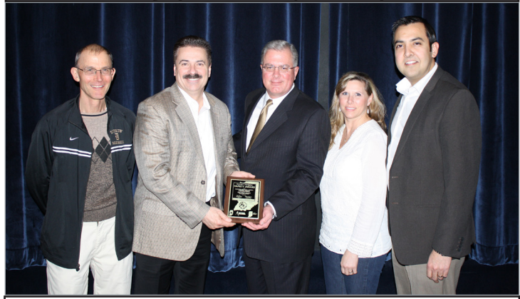
Mead Johnson Nutrition - Evansville Campus - Education and Outreach - Internal for a Large-Sized Company

This dedication to employee safety has left My-te Products, Inc., injury-free for the past three years