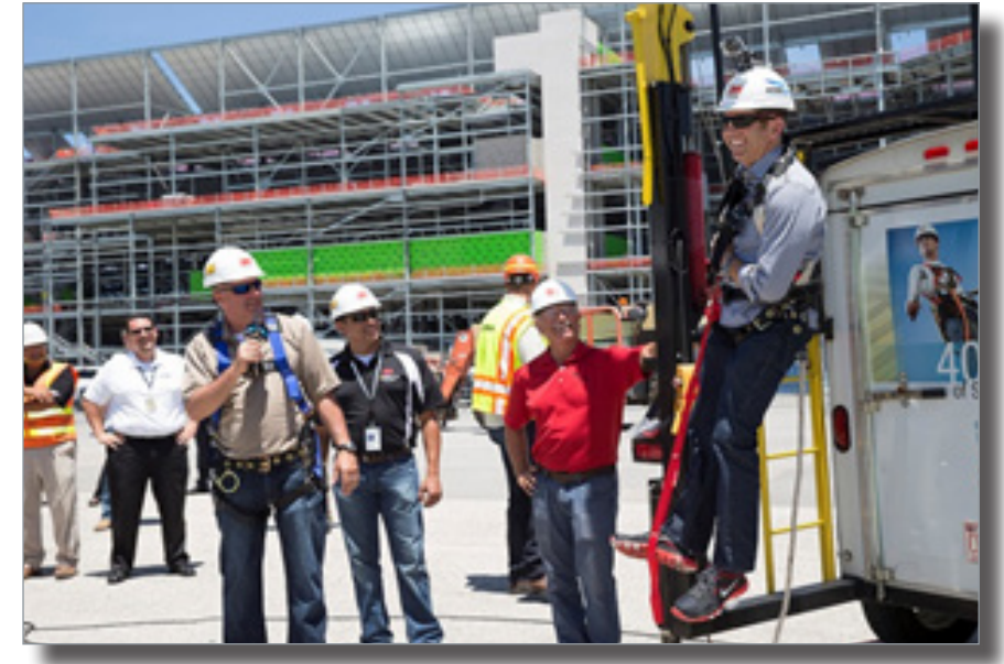
As part of a presentation on proper methods of fall prevention, Greg Biffle was outfitted in a safety harness and hoisted off the ground at the Daytona International Speedway.

The Stand-Down was a tremendous success, reaching more than 1 million workers and thousands of employers. Almost