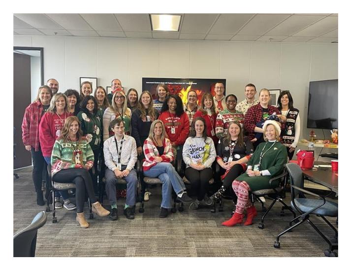
Happy holidays from IDOE's School and Community Nutrition Team!

This weekly newsletter from the Indiana Department of Education (IDOE) is dedicated to providing education, training, and technical assistance opportunities to school nutrition professionals, helping to ensure seamless operations for those participating in the U.S. Department of Agriculture's (USDA's) Child Nutrition Programs. If you are the food service contact for your school or facility, please be certain that everyone on your team has access to this important information.