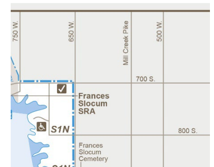
S 700W and W 800S Closure