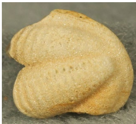
Figure 4: Crassiproteus pygidium composed of quartz.