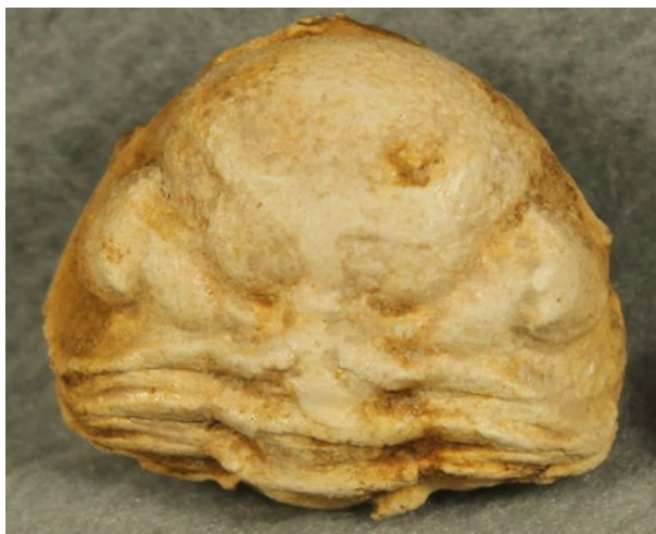
Figure 3: Eldredgeops is a common trilobite in the Devonian. It is most often found disarticulated or enrolled. It has large compound eyes.

The Sellersburg Limestone (Silver Creek Chert) is probably the richest Devonian source of trilobites in the area. Eldredgeops is found almost exclusively. Complete, enrolled specimens are not rare, but require luck to find. Flattened specimens are much rarer. Cephalons with well-preserved compound eyes are fairly common, as are pygidia and pygium-thorax combinations. Chert can be glassy, but is far more common as porous, impure material with poorly preserved specimens.