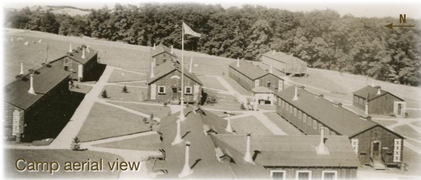
Camp aerial view