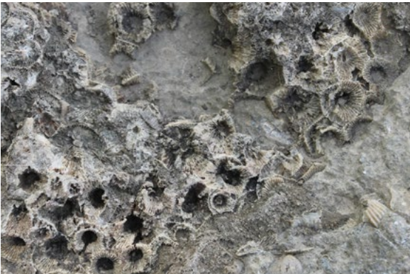
Pristatophyllum : Petoskey Stone Colonial Rugose Coral