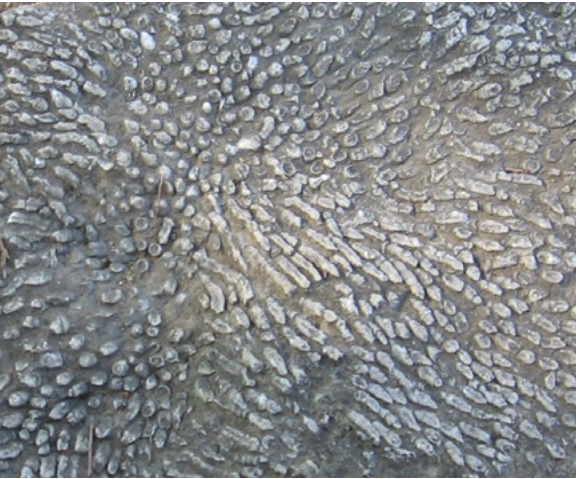
“Pipe Organ” Coral: Eridophyllum