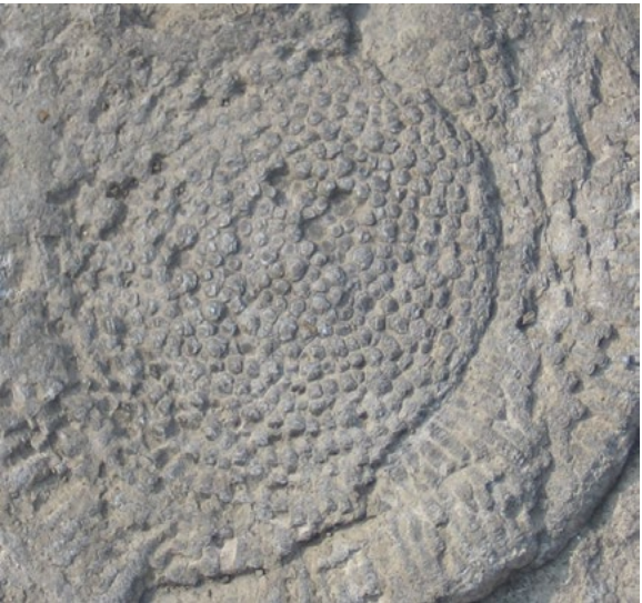
“Wasp Nest” Coral: Pleurodictyum