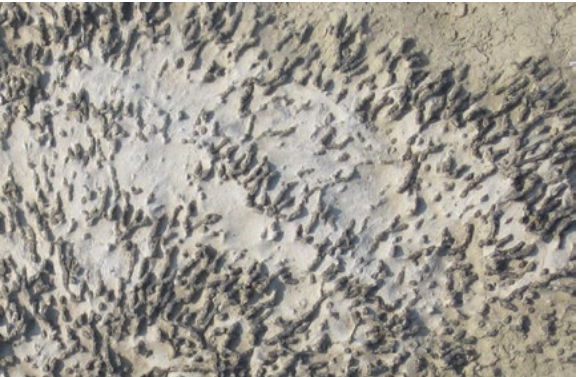
“Tube” Coral: Aulocystis