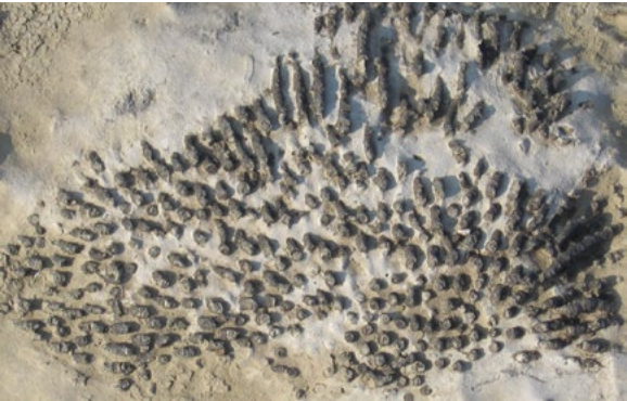
“Pipe Organ” Coral: Acinophyllum