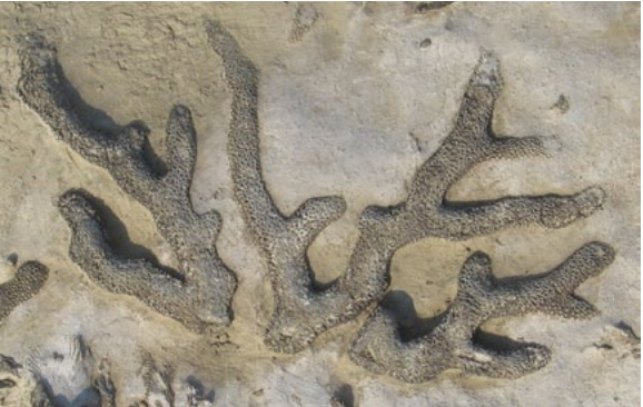
Branching Coral: Thamnopora