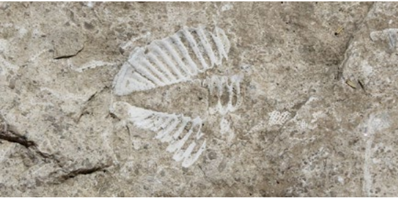
Trilobite tail: Crassiproteus