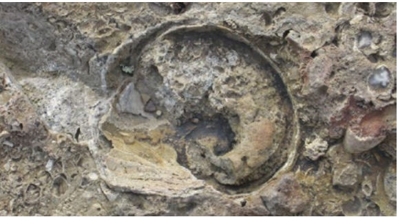
Snail: Turbinopsis Also small horn corals and brachiopods in the Brevispirifer zone.