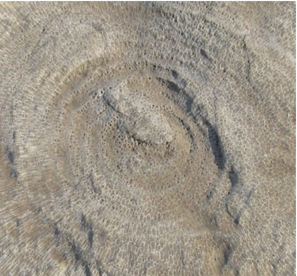
Honeycomb Coral: Favosites These are the most common colonial corals on the fossil beds.