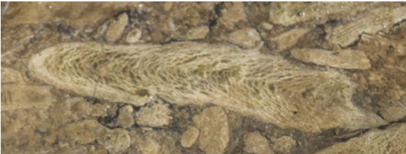
Horn coral: Cystiphyllodes Getting fossils wet shows much more detail.