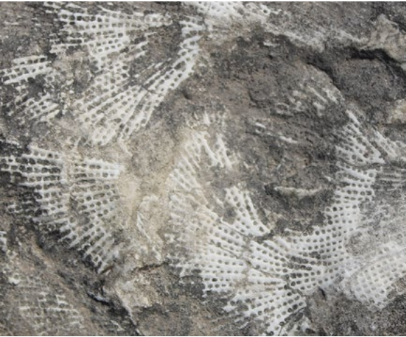
Fenestrate “Lace” Bryozoan