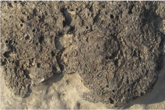
Stromatoporoid sponge with holes from embedded horn corals. These look like petrified cow pies on the lower fossil beds.