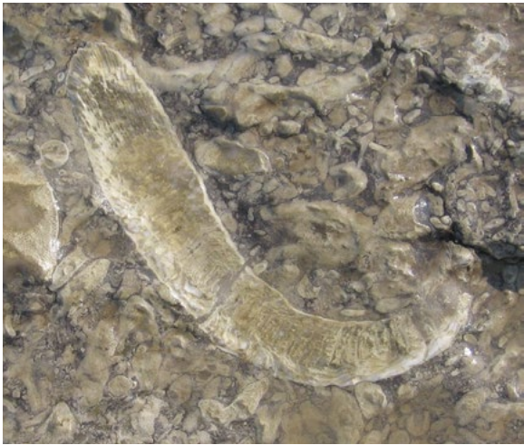
Horn Coral: Siphonophrentis (we call it a “tusk coral”) with many other corals in the coral zone

The “claim to fame” of the lower fossil beds is that it is possible to walk over a single layer on the ancient ocean floor for several acres, which is a rare geological opportunity that could be compared to walking on a dry ocean bottom today. This layer is dominated by colonial corals, horn corals and sponges called stromatoporoids. The uniform texture of the rock in the giant coral and sponge colonies causes them to erode at a different rate from the surrounding limestone, resulting in low mounds. Where corals occur as thousands of tiny “fingers” in the limestone, splash water on them and they will stand out, showing exquisite detail. The illustrations in this brochure will help you recognize certain kinds of fossil corals. There are over 100 species of coral in the lower fossil beds. To keep things simple, this brochure uses common names when they are available.