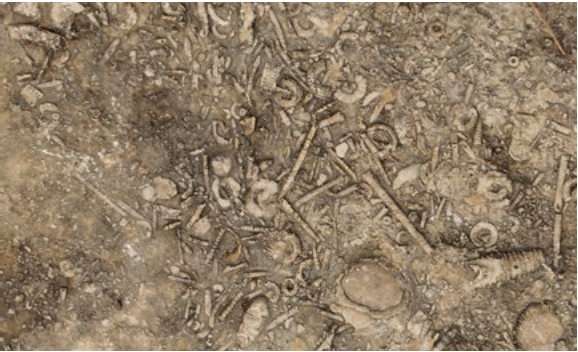
Crinoid columns and disks