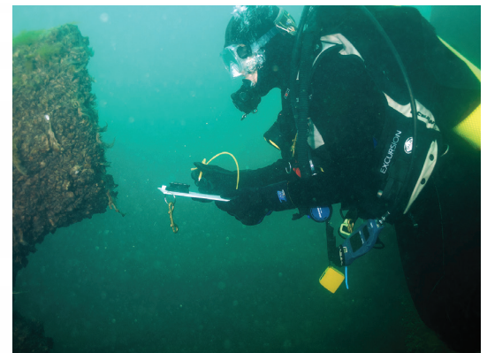
Archaeologist recording shipwreck.