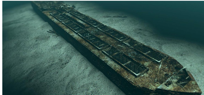
Virtual Tour of the Material Service (DNR NP website).

Lake Michigan has 14 known shipwrecks in Indiana's waters, but as many as 50 are suspected. These ships date from the later 19 th to the early 20 th centuries and were mainly used for commercial and industrial transport. You can learn about these wrecks and more on the Indiana Department of Natural Resources website at IndianaShipwrecks.org , which features a virtual tour of