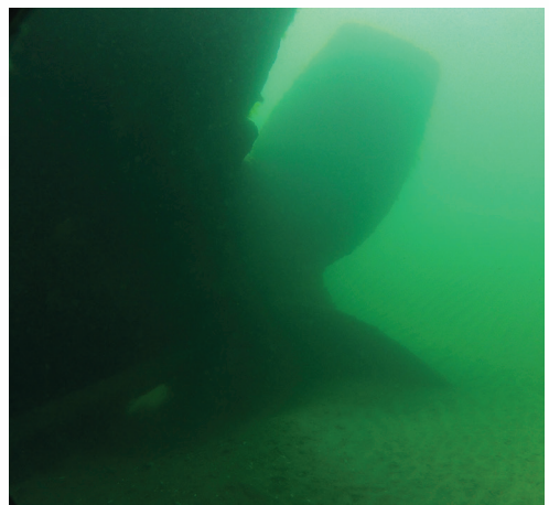
Propeller of the George F. Williams Shipwreck.