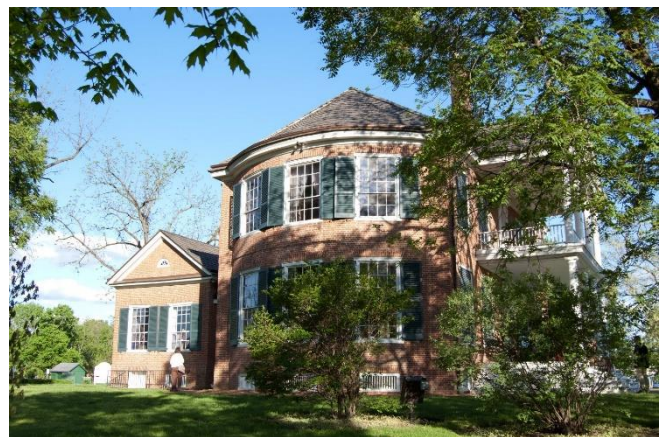
Grouseland Photos from SHAARD