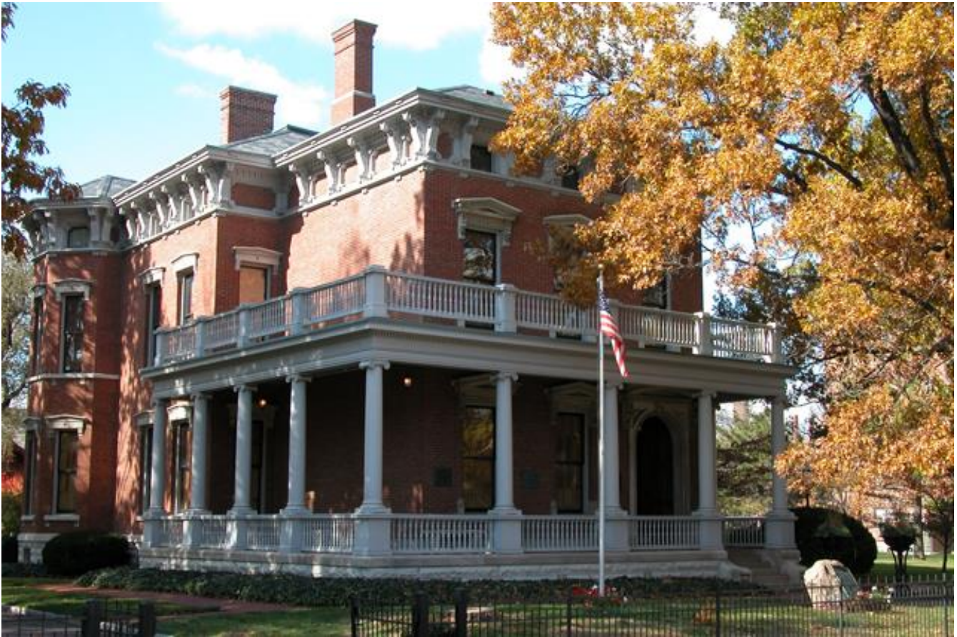
Benjamin Harrison Home