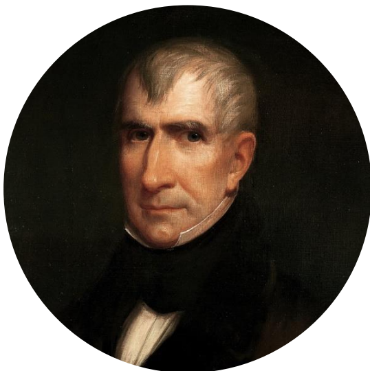
William Henry Harrison

Since its inception in 1789, the Office of the President of the United States of America has been filled by 45 men in 46 presidencies. The President serves in the nation's highest office as both head of state, head of government, and Commander-In-Chief of the armed forces. Although no U.S. President was born in the State of Indiana, Indiana is home to three National Historic Landmark properties with presidential ties: William Henry Harrison's Mansion "Grouseland" (Knox County), Lincoln Boyhood National Memorial (Spencer County), and Benjamin Harrison Presidential Site (Marion County). While most properties listed in the National Register of Historic Places are of state and local significance, National Historic Landmark status is the highest ranking for historic properties with exceptional national significance to American history.