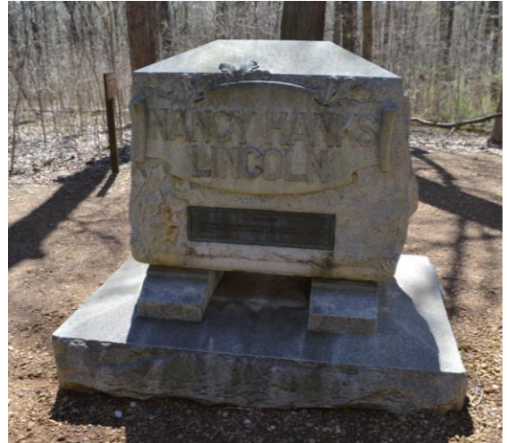
Lincoln Boyhood National Memorial