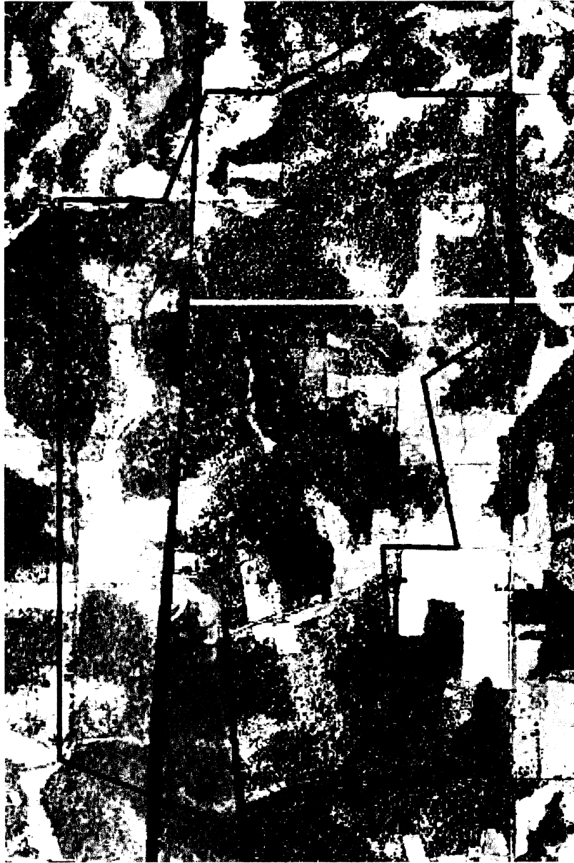
Figure 1. 1939 Aerial of OPSF with proposed HCVF Area