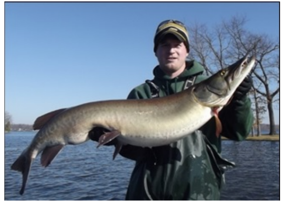
A hefty 48.5" female Muskie collected during annual brood stock collection.

Recent Stockings: Annually 3,000 Muskellunge Best Fishing: Muskie, Bluegill, Largemouth Bass, Yellow Perch