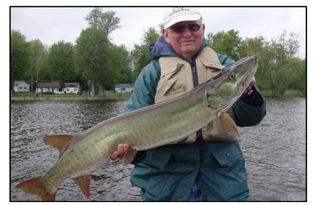
A happy angler with a Muskie from Skinner Lake.