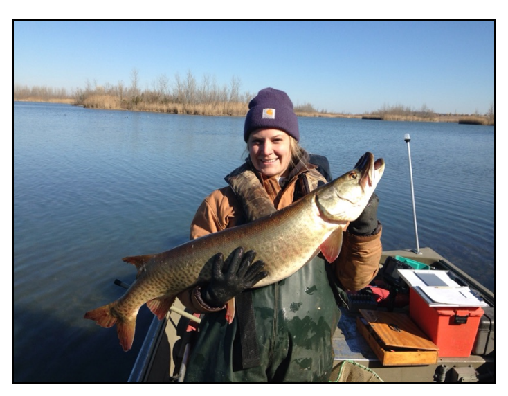
43" Muskie collected from a 2017 netting survey.