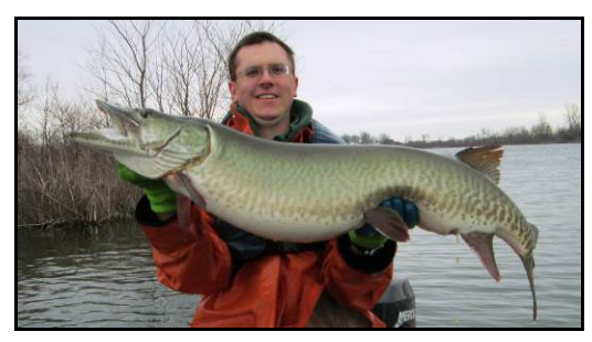
48" Muskie collected from a 2013 netting survey.