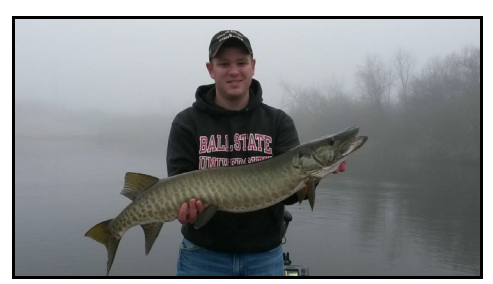
A 40" Bass Lake Muskie.