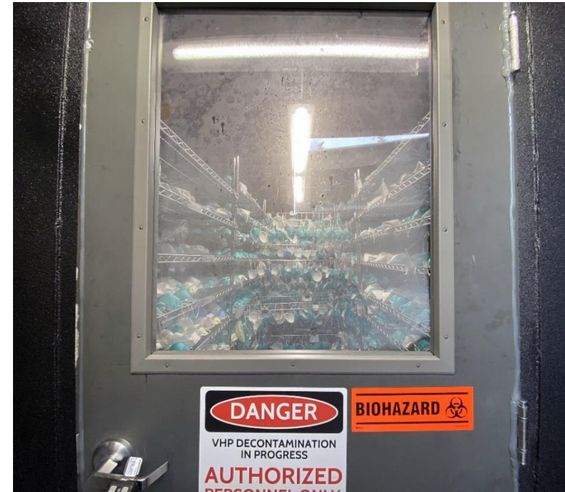
Testing Run Cycles