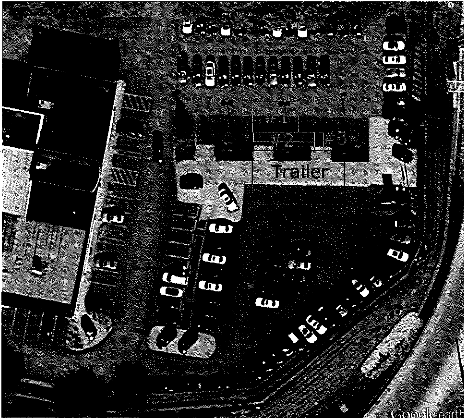
Site Plan 9375 Whitley Dr.