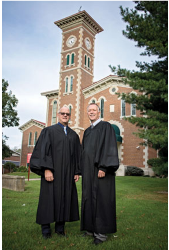
Judicial officers from Jennings County stand outside the county courthouse in Vernon, which was completed in 1860.

Yes, I said “customers.” It’s not common for us to call court users customers. Justice is not for sale, and we don’t have a product that can be changed to satisfy the needs of every person. But what we do have is a constitutional charge to provide open, accessible, and fair courts. That is achieved only when we place litigants, victims, witnesses, jurors—all court customers—at the center of every equation, just as our courthouses are at the center of every community.