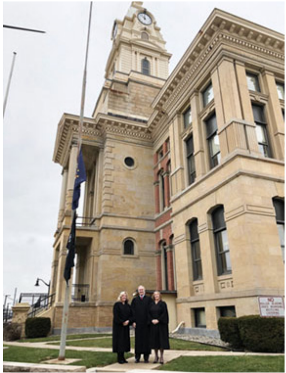
Judicial officers from Montgomery County stand outside the county courthouse in Crawfordsville, which was completed in 1876.