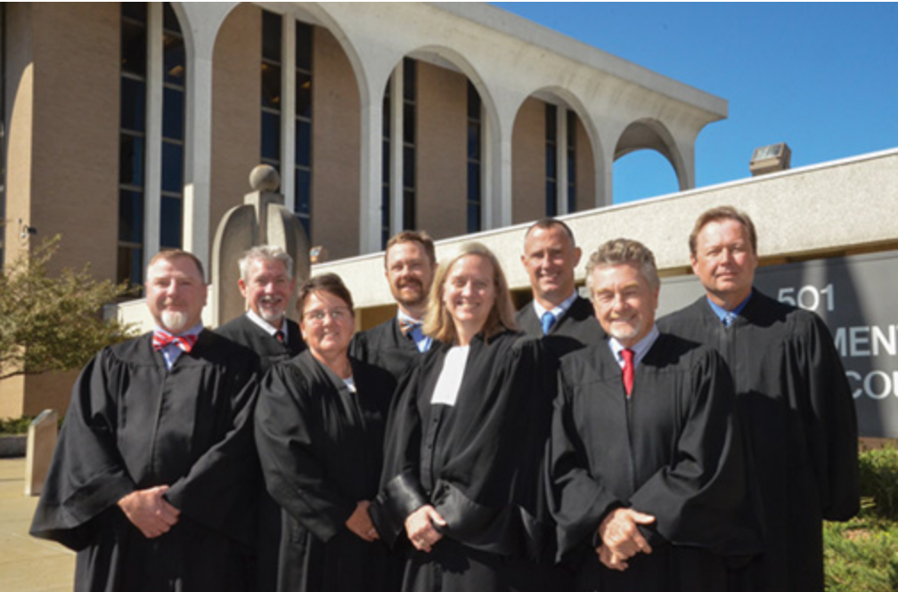
Judicial officers from Clark County stand outside the justice center in Jeffersonville, which was completed in 1970.