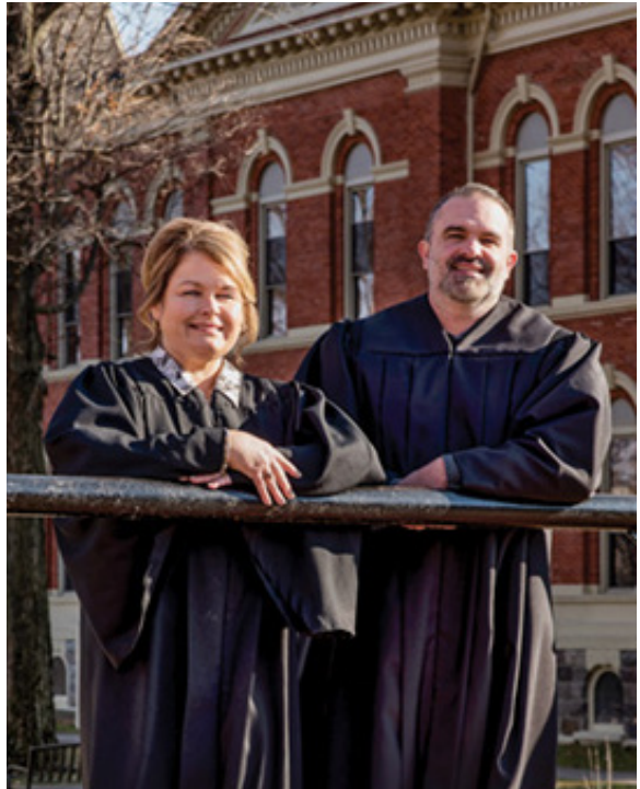
Judicial officers from LaGrange County stand outside the county courthouse in LaGrange, which was completed in 1879.