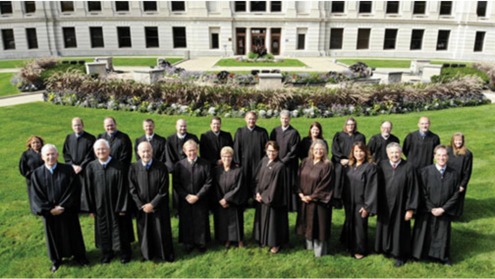
Judicial officers from Allen County stand outside the county courthouse in Fort Wayne, which was completed in 1902.