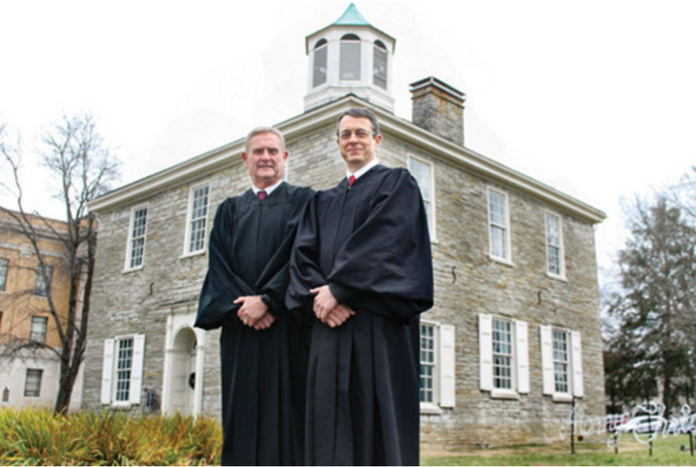
Judicial officers from Harrison County stand on the courthouse square in Corydon, which includes the 1816 building that housed the state's original Supreme Court.

Thank you, thank you, thank you to the 7,780 Hoosier attorneys and hundreds of law students who donated over a half-million hours of volunteer legal services last year to help meet the Coalition's goals of improving the quality of civil legal services for those of limited means.