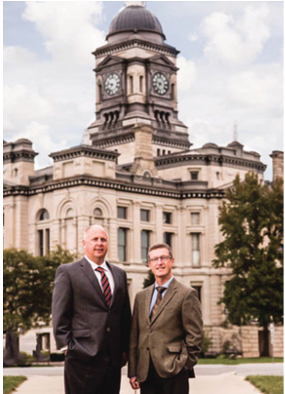
Judicial officers from Clinton County stand outside the county courthouse in Frankfort, which was completed in 1884.