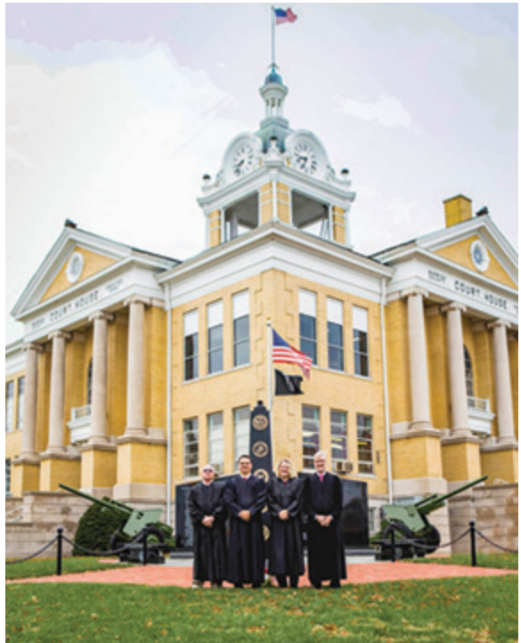
Judicial officers from Warrick County stand outside the county courthouse in Boonville, which was completed in 1904.