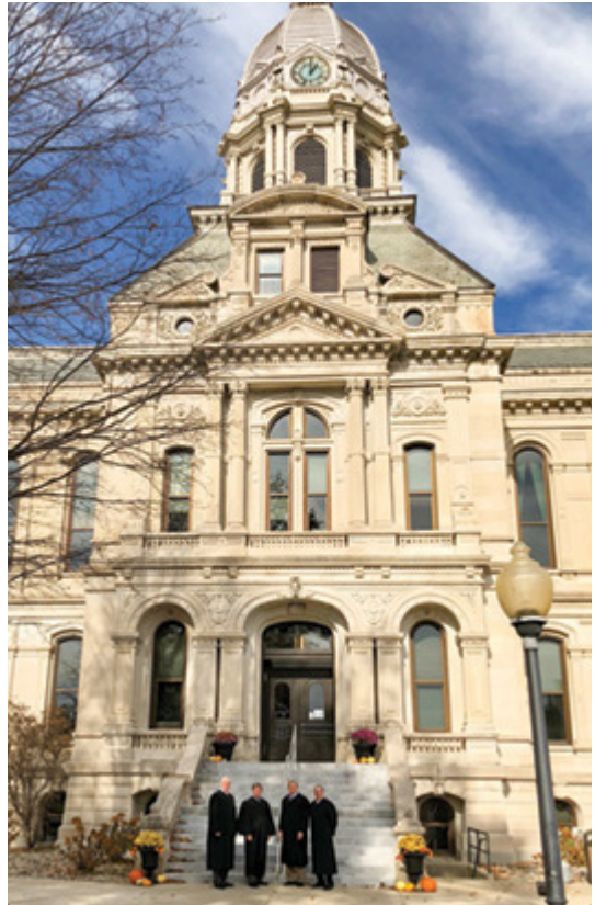
Judicial officers from Kosciusko County stand outside the county courthouse in Warsaw, which was completed in 1884.

To address this vital need of fundamental fairness, we created the Coalition for Court Access, made up of 20 legal stakeholders who provide a focused and comprehensive organizational structure for Indiana's civil legal-aid programs.