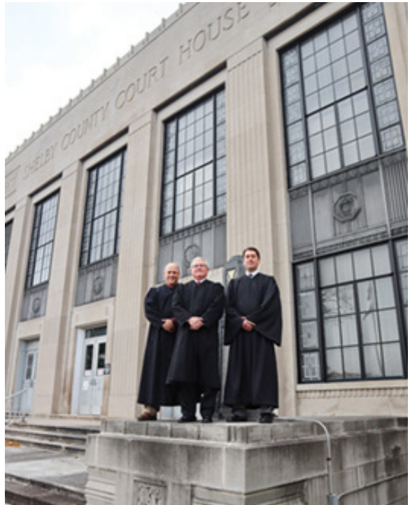
Judicial officers from Shelby County stand outside the county courthouse in Shelbyville, which was completed in 1937.

These courts have a proven track record of reducing recidivism while keeping our citizens safe. We are very proud to say 85% of all Indiana problem-solving court participants remained arrest-free last year. We are working hard to close that long-standing revolving door back into the criminal justice system.