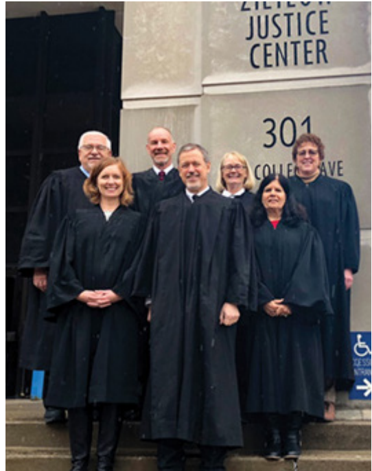
Judicial officers from Monroe County stand outside the justice center in Bloomington, which was completed in 1985.