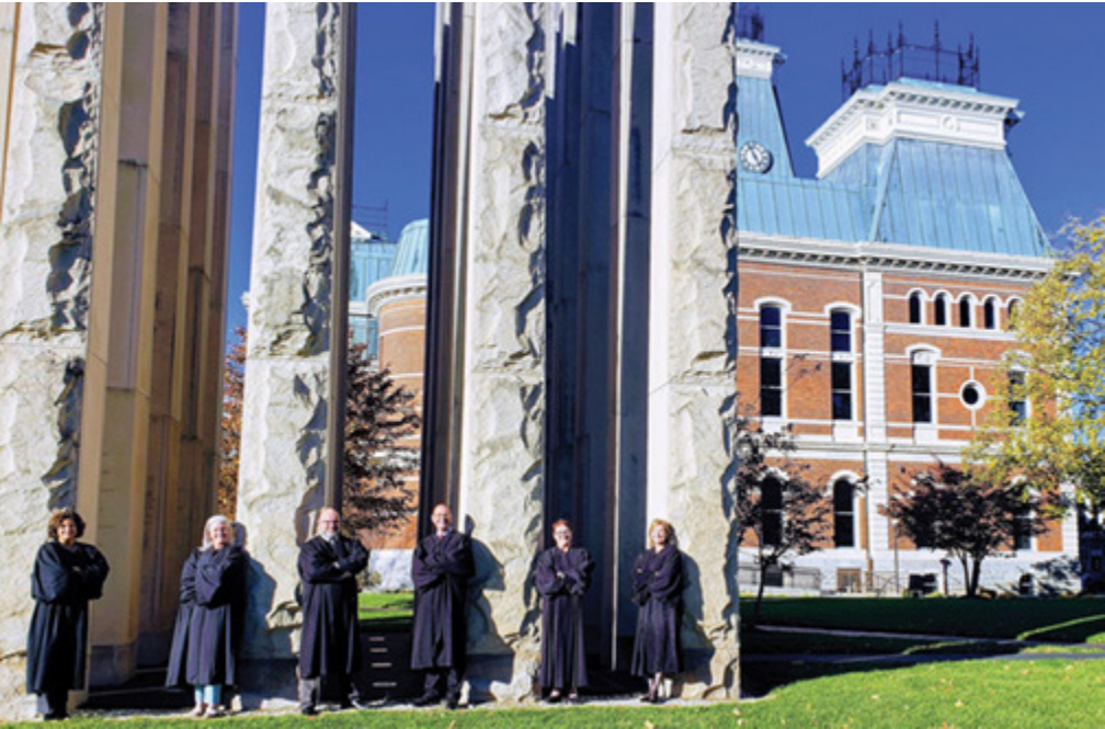
Judicial officers from Bartholomew County stand outside the county courthouse in Columbus, which was completed in 1874.