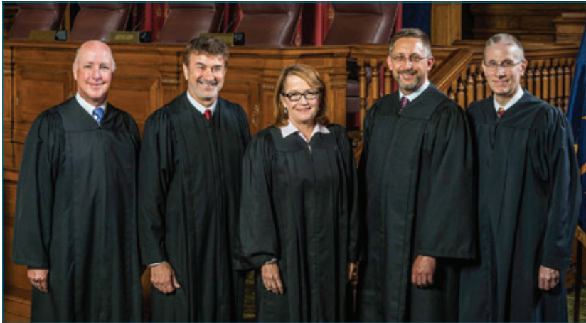
The five justices of the Indiana Supreme Court.