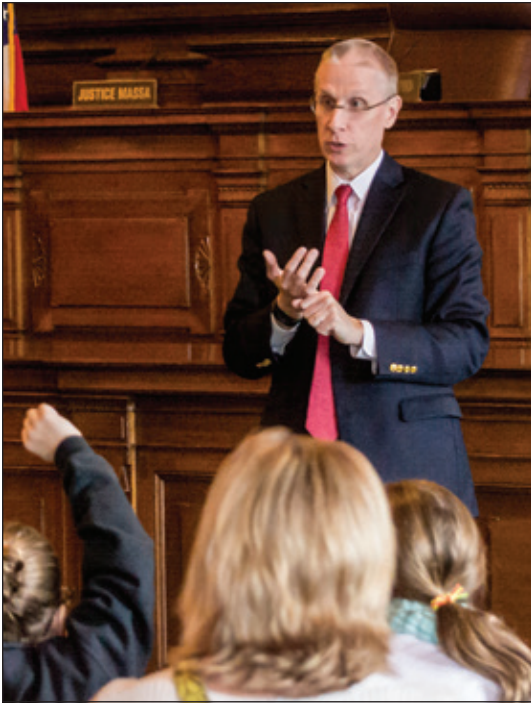
Justice Geoffrey Slaughter spoke to students in the Supreme Court Courtroom as part of Statehood Day.