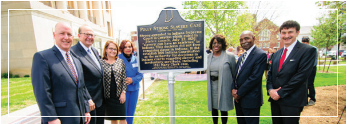
Supreme Court Justices at the Polly Strong marker unveiling during the Corydon Bicentennial Celebration.