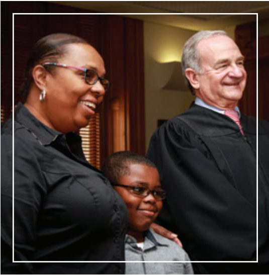
Tippecanoe Co. Judge Thomas Busch with a family after an adoption proceeding.