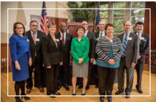
Supreme Court Justices with Delaware Co. Judges at a luncheon following a traveling oral argument.