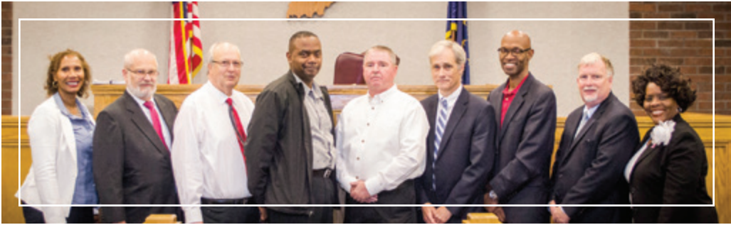
The nine judges of the Marion County Small Claims Courts at an October meeting.