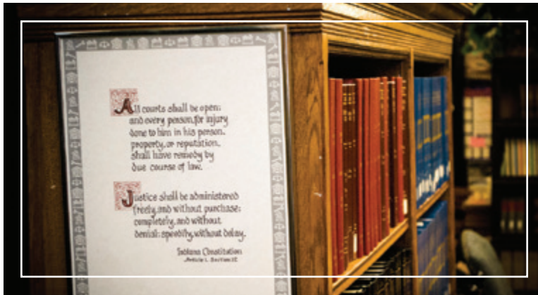
Guiding words from the Indiana Constitution in the Supreme Court Law Library in the Indiana State House.

I doubt you would be surprised to know that those guiding words from the Indiana Constitution hang in the law library down the hall. You may not know that our library's collection also includes Indiana's 1853 legislative enactments, written not only in English, but also in German, as that was the native tongue of many Hoosiers at that time. Interestingly, our leaders also had the 1851 Constitution printed in German as well as English.