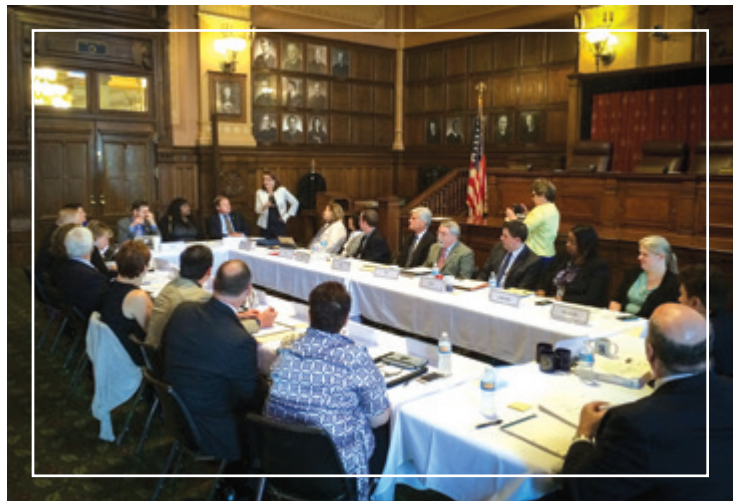
The August 2016 inaugural meeting of the Coalition for Court Access.