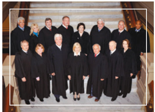
The 15 Judges of the Court of Appeals of Indiana.