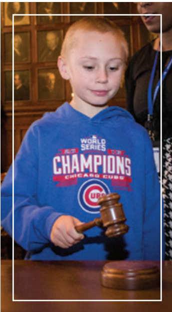
Children play the role of judge during Statehood Day celebrations in the courtroom.