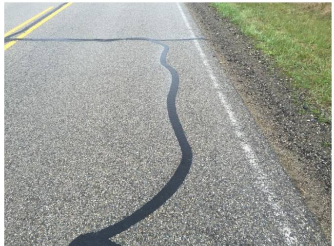
Figure 5 - Contractor Crack Seal