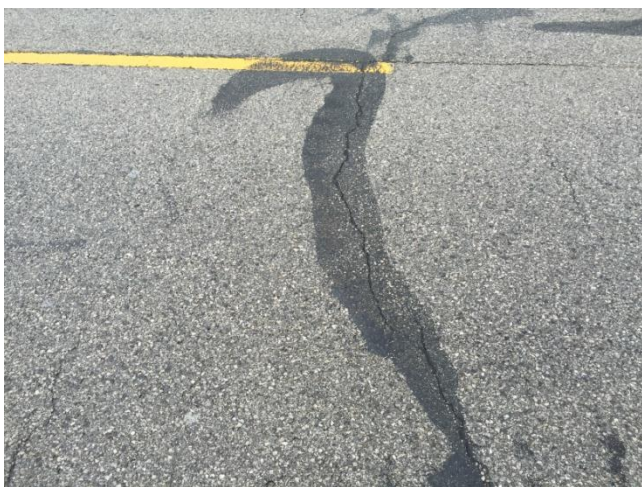
Figure 4 - In-house Crack Seal

The second method is contracted utilizing special materials and equipment. The contracted crack seal is an asphalt binder (PG 64-22) or polymer modified asphalt binder (PG 76-22) with suspended fiber added to the heating kettle. The material is pressure injected into cracks using a special wand. Figure 4 and Figure 5 show each respectively. Although the contractor method is more expensive, it provides a significantly better seal and does not require highway department labor.