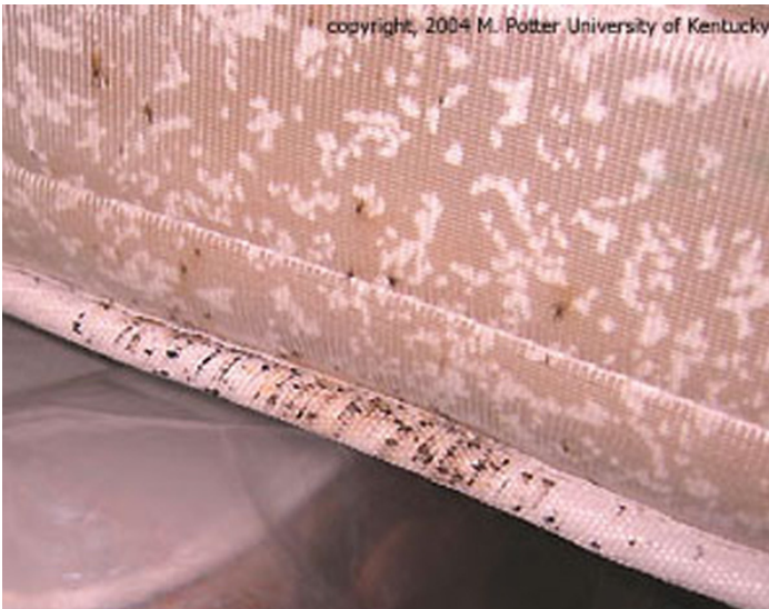
Bed bug infestation of a mattress