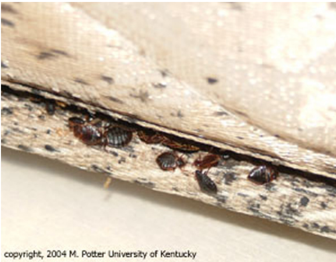
Bed bugs on a mattress seam