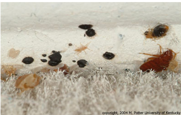
Bed bugs on a carpet

Humans can aid the dispersal of bed bugs from one structure to another via the movement of infested bedding, furniture, and packing materials. Even more widespread dispersal is associated with infested clothing, luggage, and perhaps lap top computers of travelers. International travelers from countries that have heavy bed bug infestations can be a source of bed bug infestations in hotel rooms, and there has been an increasing incidence of bed bugs in lodging establishments around the world, including in the U. S. Dependent only on a source of blood, bed bugs do not require unsanitary conditions characteristic of infestations of cockroaches. Bed bugs do not discriminate between economy or luxury hotel rooms, and they can exist in the cleanest hotels, motels, apartments, and homes.