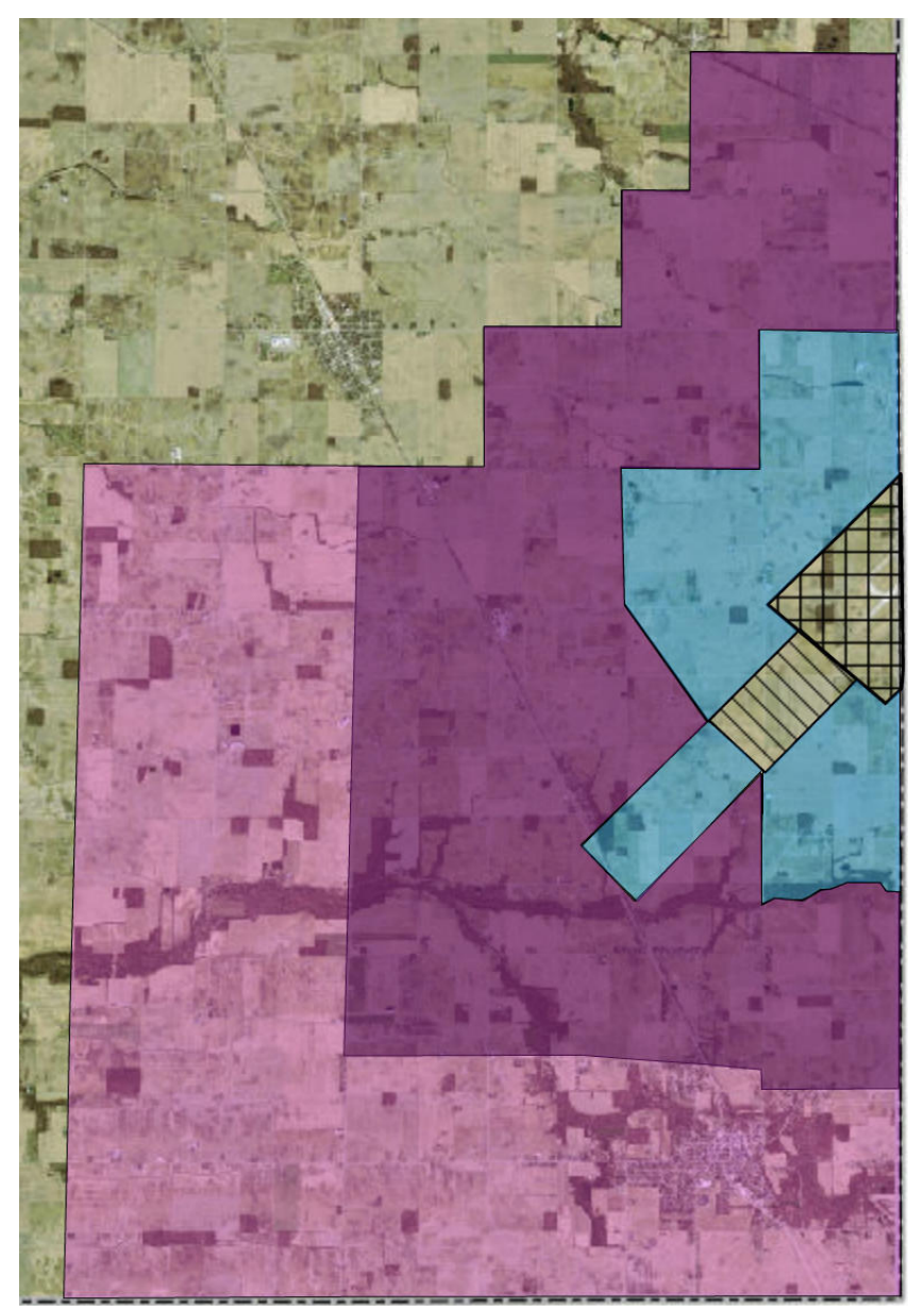
Cross Area: combination Clear Zone; Diagonal Area: APZI; Blue Area: combination APZII; Purple: Inner Conical Area; Pink: Outer Conical Area