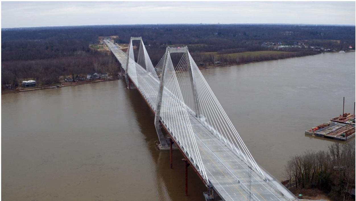
The Lewis and Clark Bridge spans the Ohio River and connects Indiana State Road 265 with Kentucky State Highway 841.

Long before the Indiana General Assembly codified it as the State's official motto in 1937, Indiana has been known as the ' Crossroads of America. ' According to the Indiana Department of Transportation, over 81 Million vehicles travel Hoosier roads each year. Indiana is located within a day's drive of two-thirds of the nation's population and with over 14 Interstate highways beginning in, ending in, or passing through Indiana, it comes as no surprise that our state's infrastructure is a vital part of the American economy. As Indiana enters its Third Century of Statehood, we are committed to improving the infrastructure to assure we live up to our moniker for another 200 years.