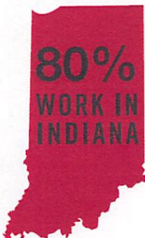
May 2023 Graduates