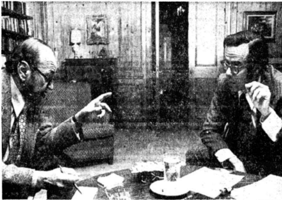
Dr. Irving Bieber (right) and Dr. Robert L. Spitzer discuss the question: "Is homosexuality a psychiatric disorder?"

"We feel we have to keep step with times. Psychiatry, which once was regarded as in the vanguard of the movement to liberate people from their troubles, is now viewed by many, and with some justification, as being an agent of social control. So it makes absolute sense to me not to list as a mental disorder those individuals . . . not in conflict with their sexual orientation."