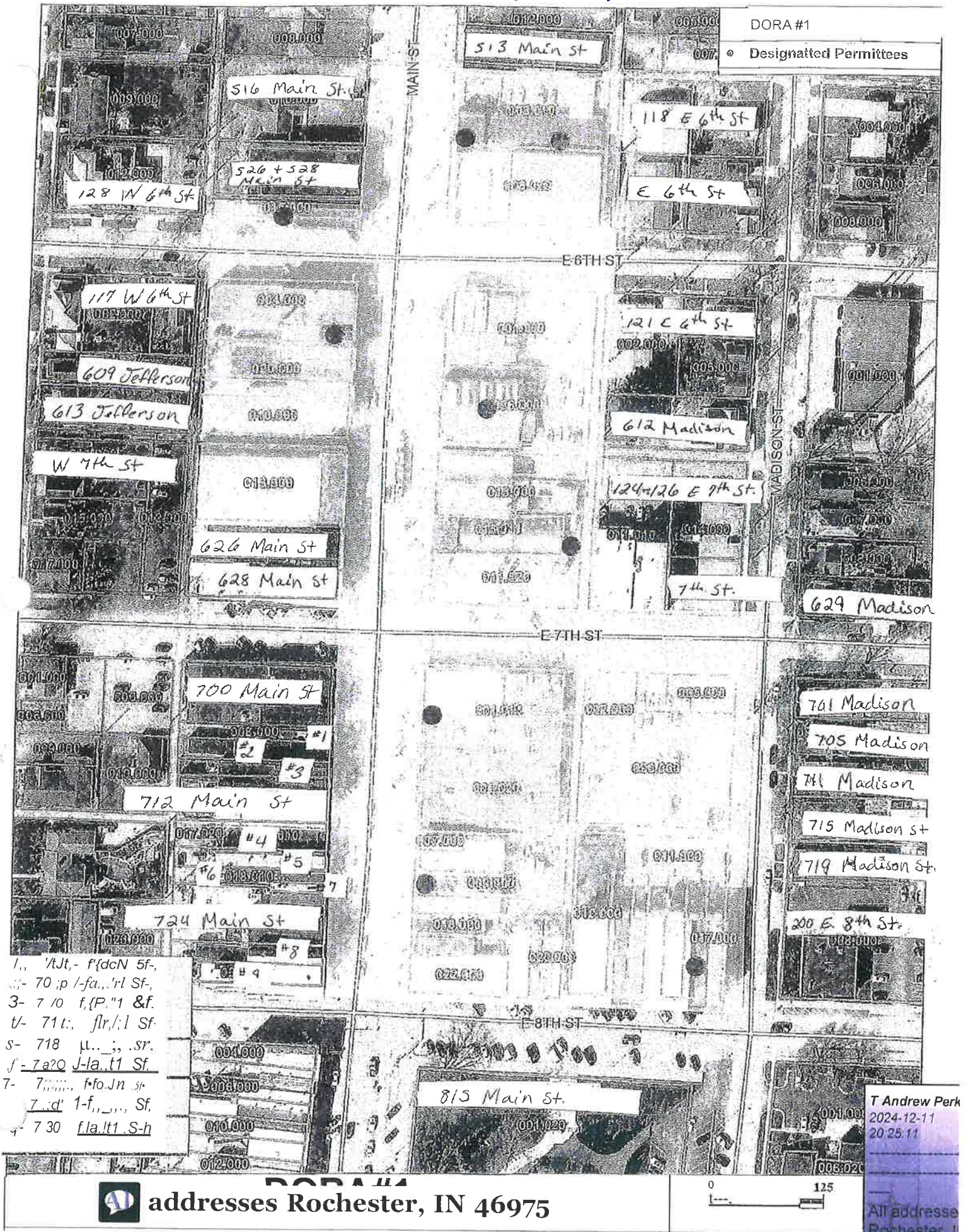
Exhibit B (cont'd.)