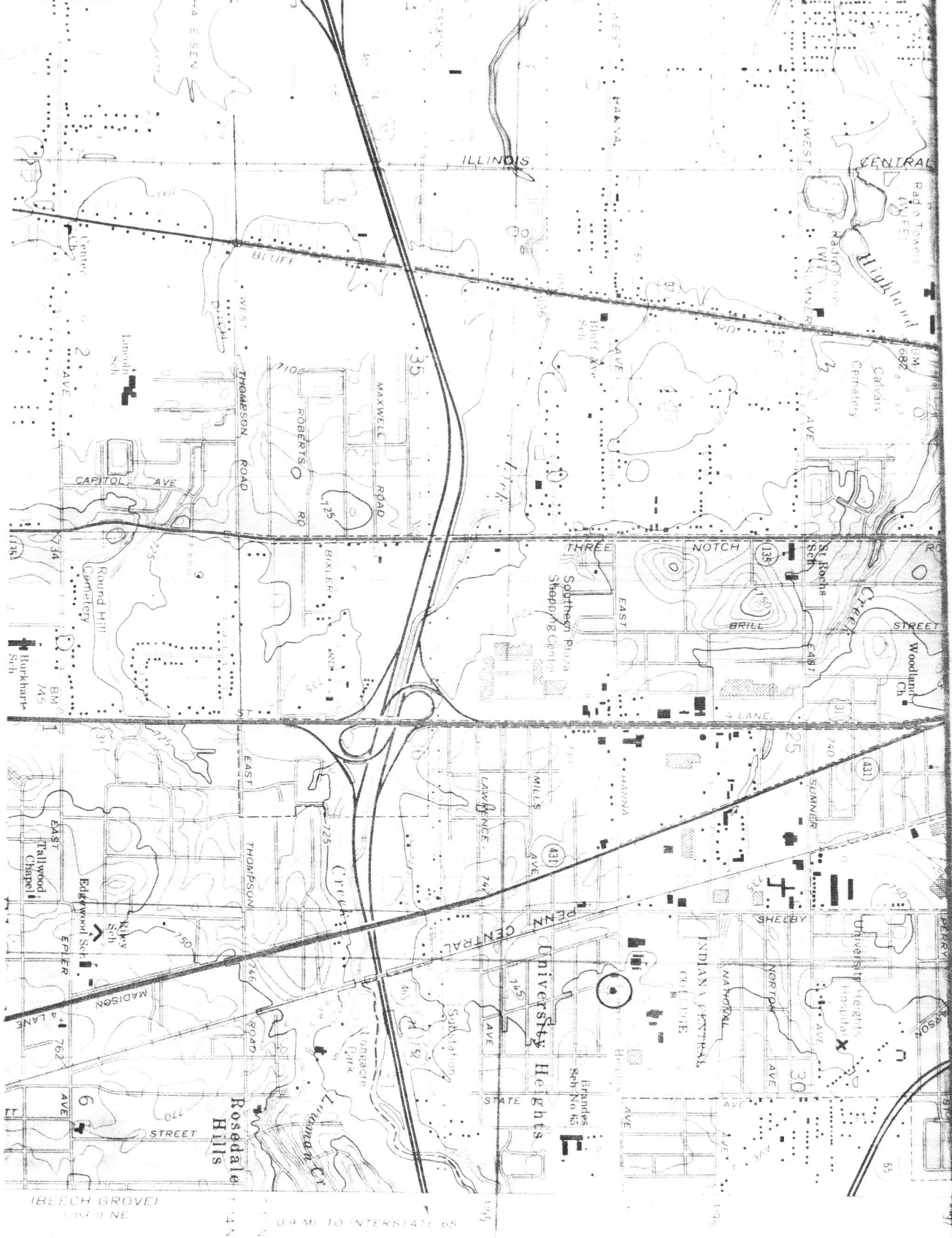
Good Hall Indianapolis, Indiana UTM Reference: 16/574130/4395490