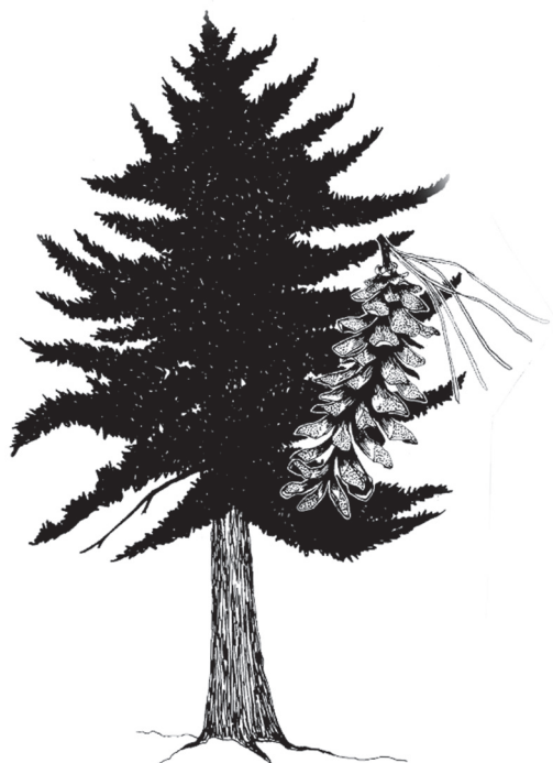
White pine with cone and needles

We hope you enjoy your nature walk and you will visit this area again. Please be sure you signed the registration sheet at the beginning of the trail. If you do not want to keep this brochure please return it to the box.